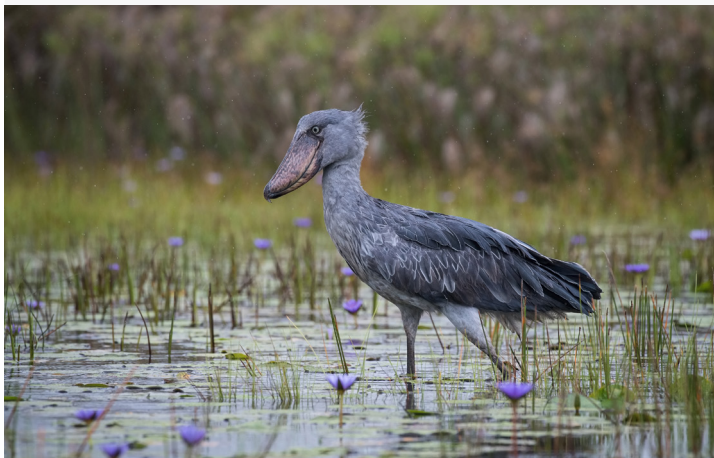
"The shoebill walking through the wetlands, Uganda"