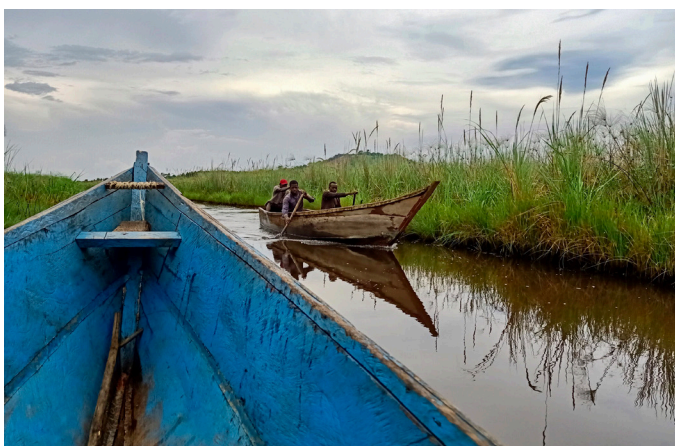
"Boat riders in the Mabamba Bay Wetland System marsh channels and papyrus vegetation"

Agriculture is the main source of livelihoods, employment, and food security for Uganda's fast growing, urban population. Smallholder livestock and crop production in urban and peri-urban areas compete spatially with conservation areas, such as the Mabamba Bay Wetland System, that provide critical ecosystem services. The TEEBAgriFood initiative will assess the impact of urban and peri-urban agriculture (UPA) and policy interventions on services such as water purification, carbon sequestration, food provisioning and recreation.