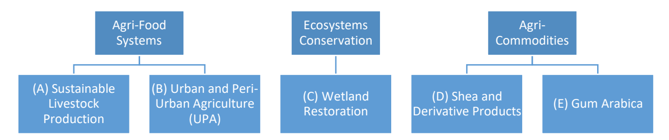
Figure 2: Policy Scoping Options for the TEEBAgriFood Uganda Application

will not be considered in full detail, in favour of policy options with a stronger and more timely policy demand for Uganda (options A, B, and C).